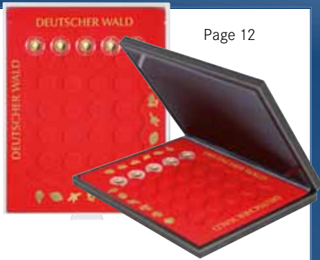
COIN CASES NERA AND COIN BOXES "DEUTSCHER WALD"