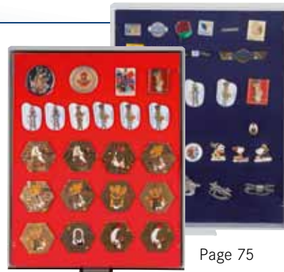
COLLECTION BOX FOR PINS/MEDALS/ EMBLEMS