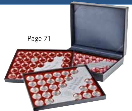
COIN CASES NERA AND COIN BOXES "LES EUROS DES RÉGIONS"