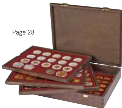
CARUS SOLID WOOD CASE